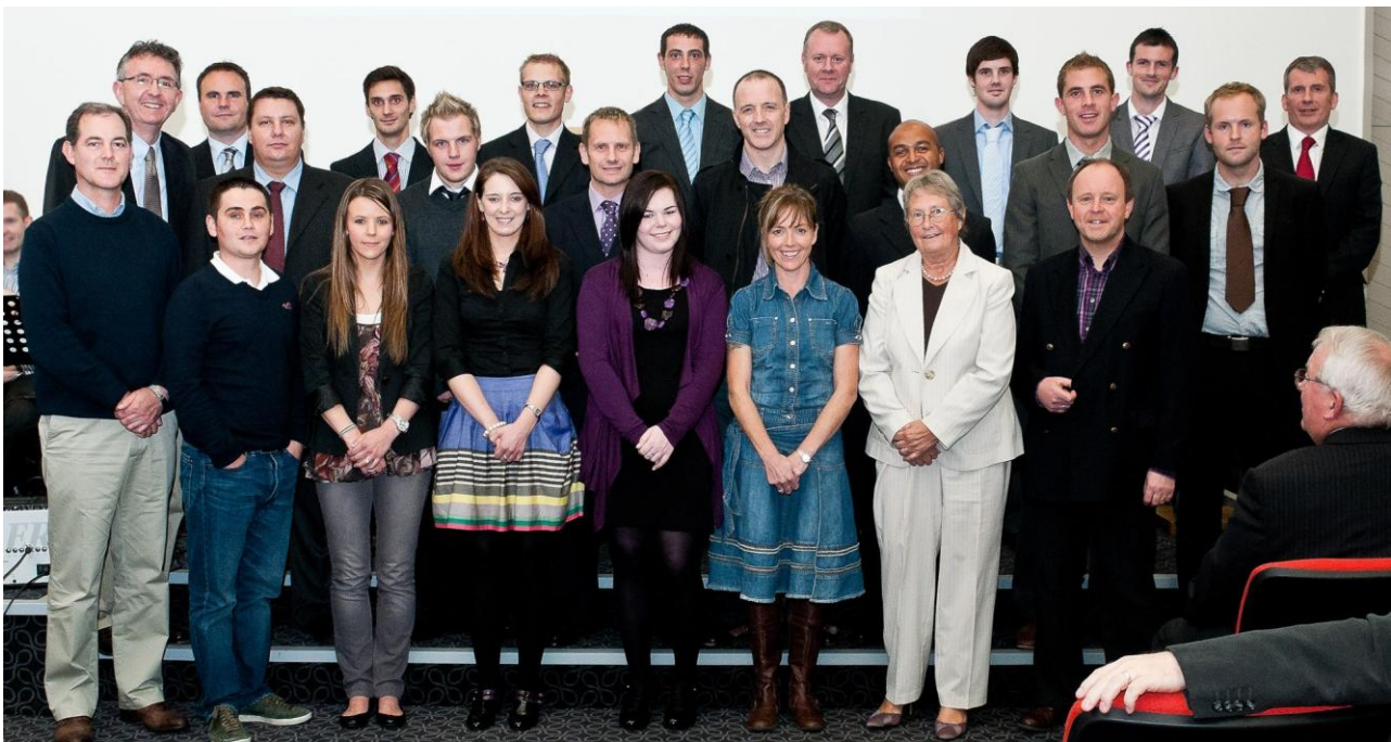
First year students and some of the incoming postgraduate students