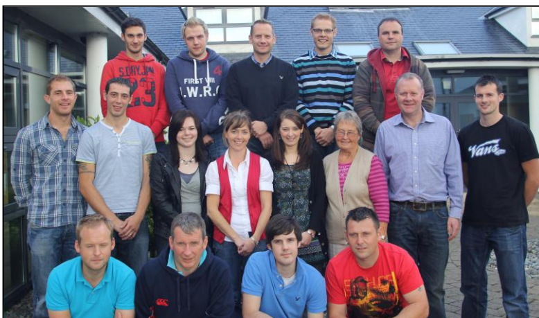
Pictured are the first year and one of the day-release students.

ENROLMENT Prayer was requested for 16 new undergraduate students and prayer was